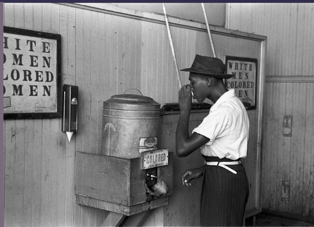
A man drinking from "Colored Men Only" fountain in the Southern United States because of the Jim Crow laws.

In the US, many laws forbid racial discrimination, and a number of these are directly derived from Title VII in the Civil Rights Act of 1964 and the Civil Rights Act of 1991. The first of these acts states that employers cannot refuse to hire qualified employees based on race or skin color, and they can't do other things like harass them, refuse promotions, or pay them at lower rates because of their race. The 1991 Civil Rights Act defines some ways that people who have experienced this discrimination can sue.