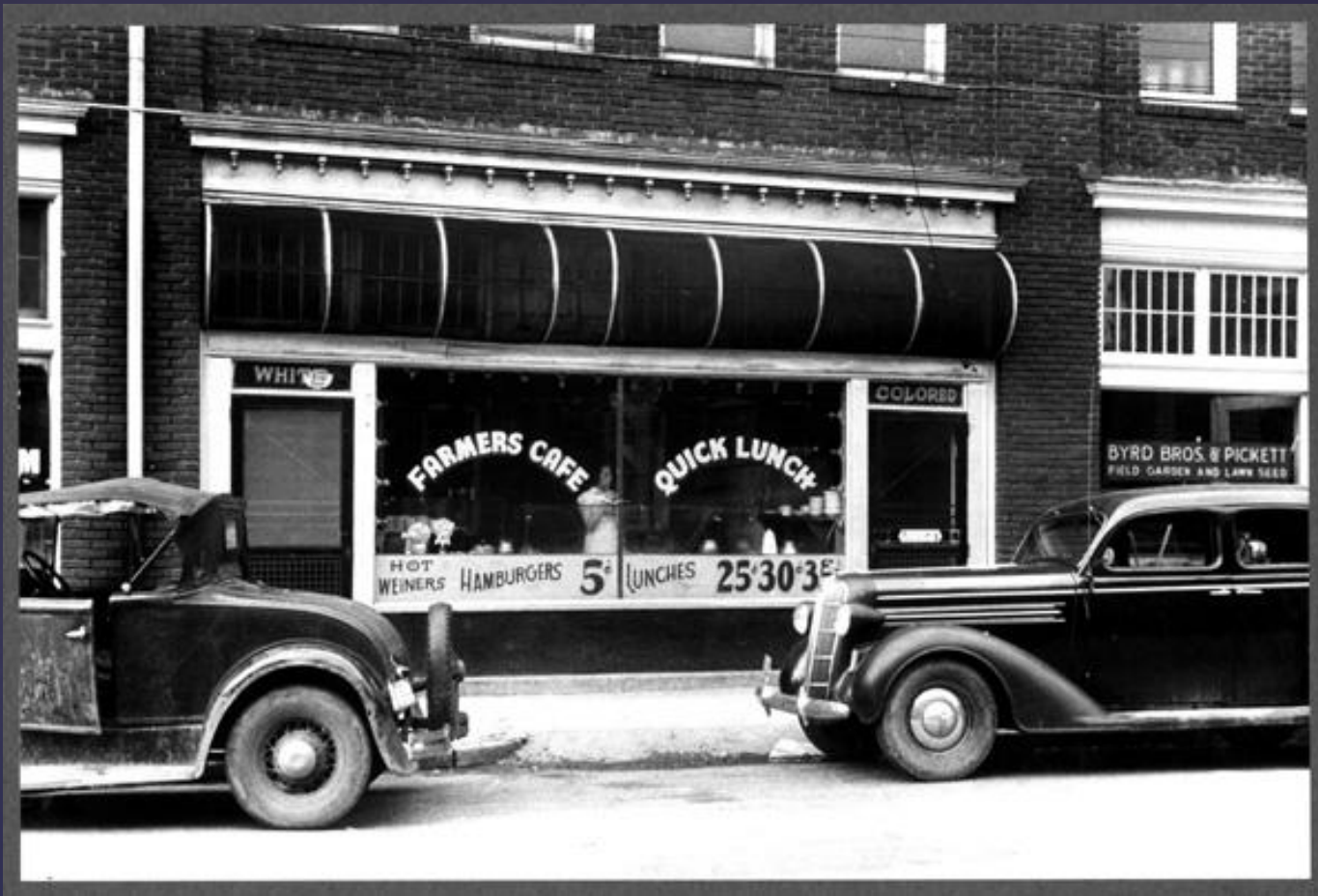
Separate "white" and "colored" entrances to a cafe in North Carolina, 1940