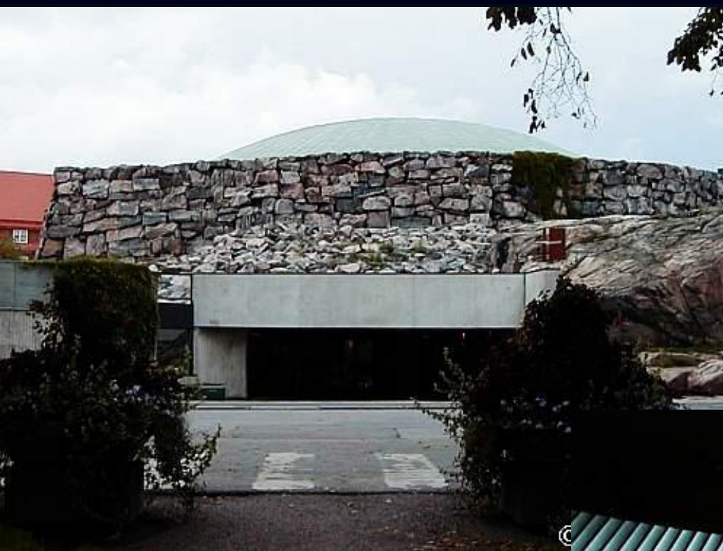
Tempeliaukio Church, also known as the Church of the Rock