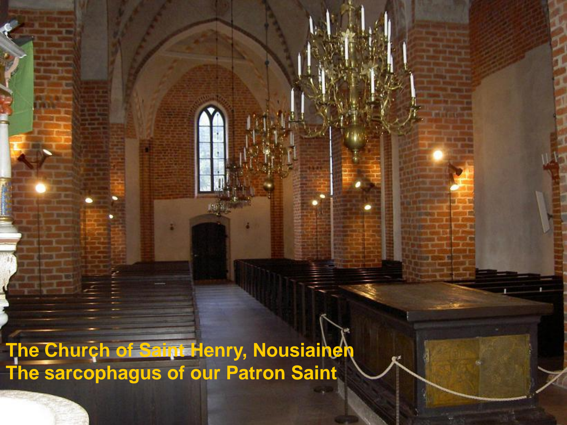
The Church of Saint Henry, Nousiainen The sarcophagus of our Patron Saint