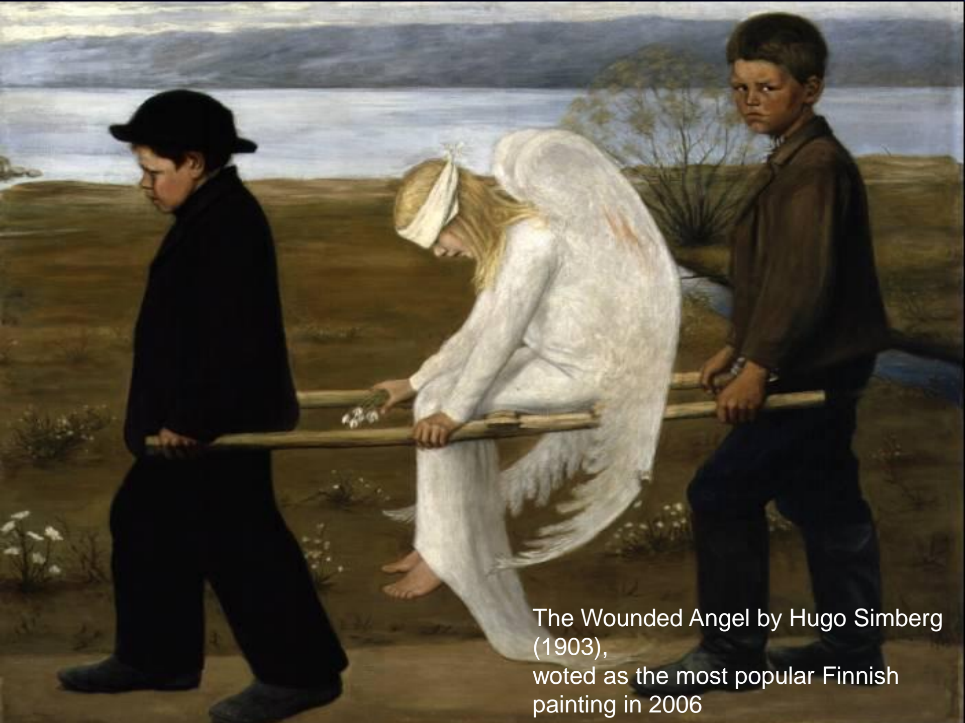
The Wounded Angel by Hugo Simberg (1903), woted as the most popular Finnish painting in 2006