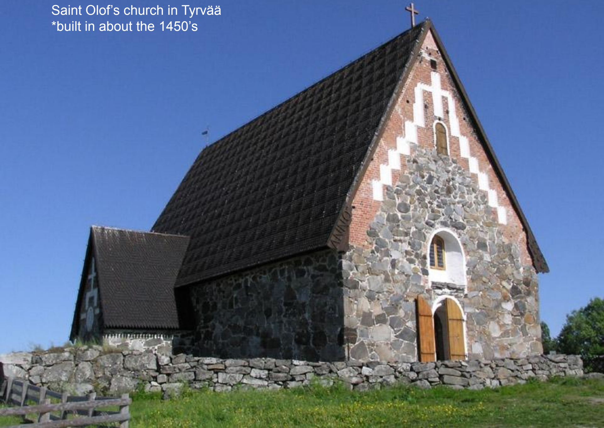
Saint Olof's church in Tyrvää *built in about the 1450's