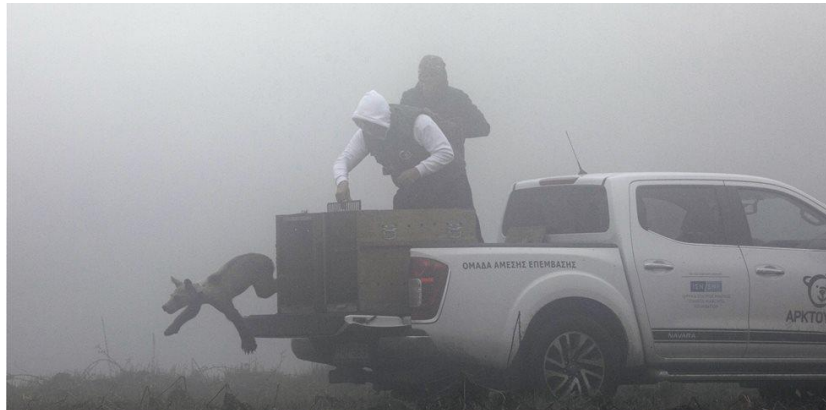
Bear Cubs Rescue, Care and Wild Release by Arcturos