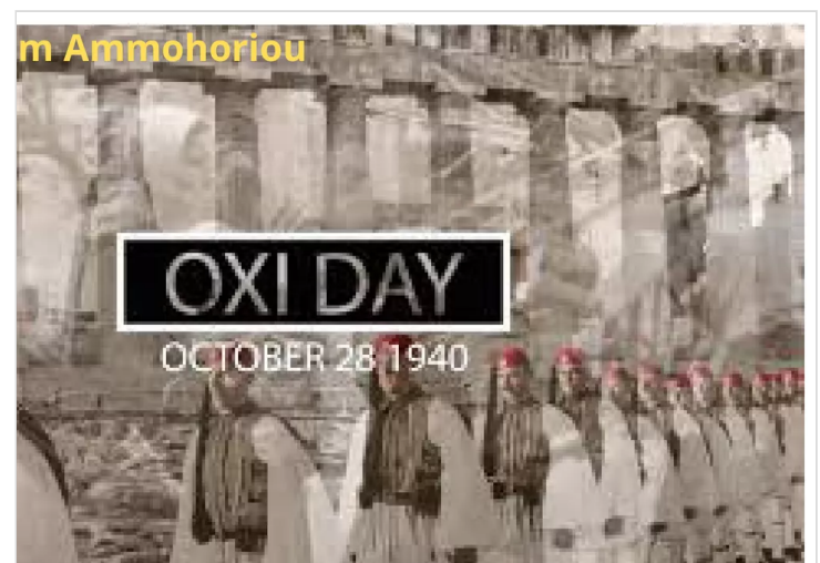
28 October 1940, the date when Greeks said OXI (OHI) and it really meant NO (1)