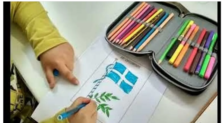
the greek flag

By the 4th and the 1st graders eTwinning teams