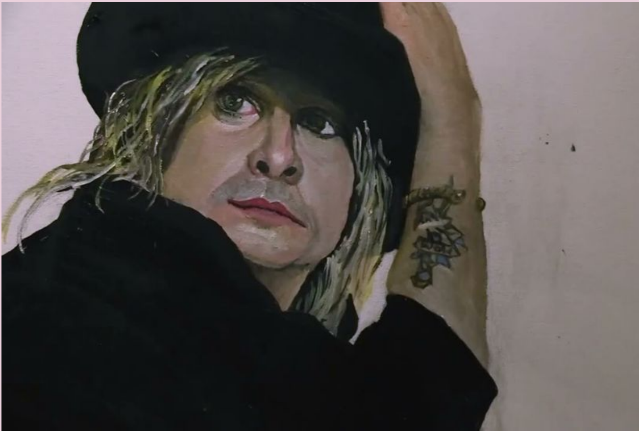
Ozzy Osbourne - rock singer

https://www.youtube.com/watch?v=IUxj2DzNutI