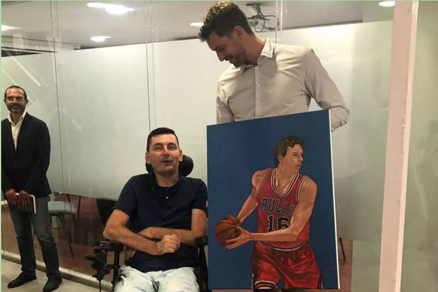
Florin Anghel together with basketball player Pau Gasol (Spain)