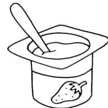
9. yoghurt = γιαούρτι