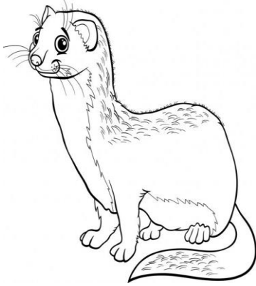
1. weasel = νυφίτσα