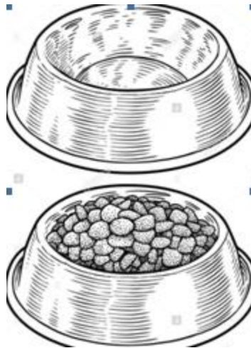
5. empty = άδειος