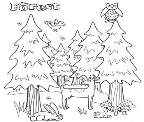
3. forest = δάσος