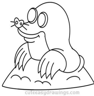
2. mole = τυφλοπόντικας