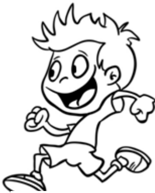
4. run = τρέχω