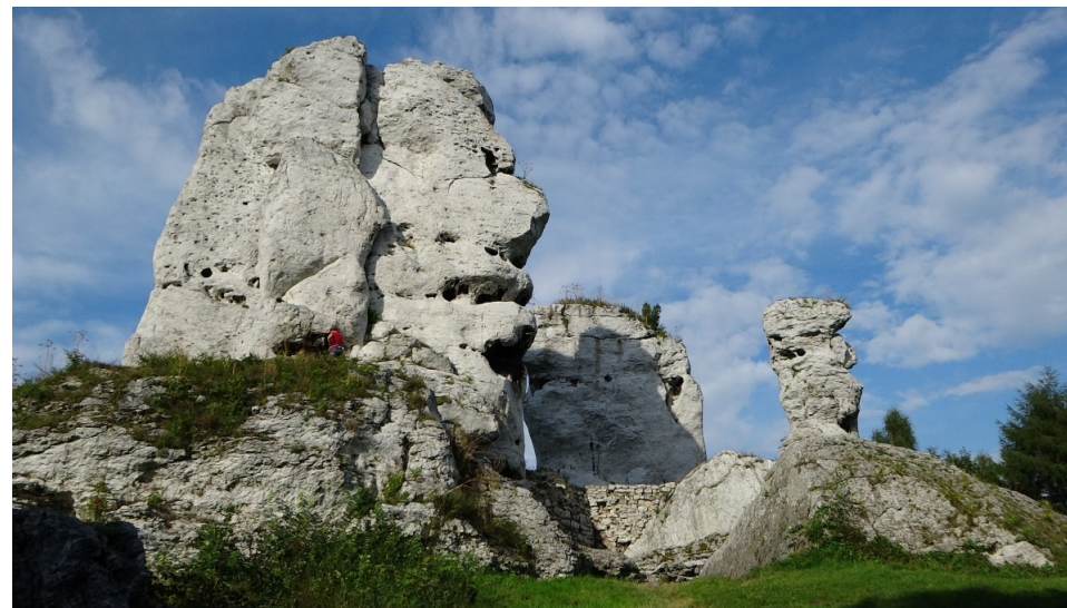
Kraków – Częstochowa Upland