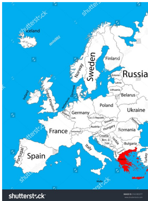
Greece in Europe