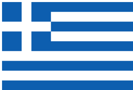
The Greek flag

Etwinning project June 2024 First Class of Pentavrysos Junior High School