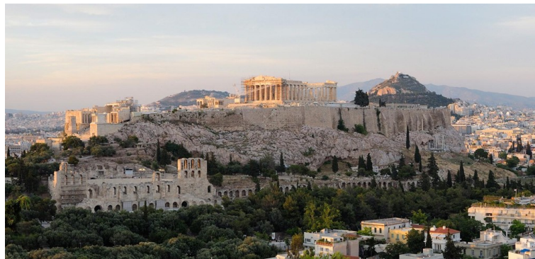
The Acropolis in Athens

Etwinning project June 2024 First Class of Pentavrysos Junior High School