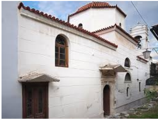
Agios Spyridonas church