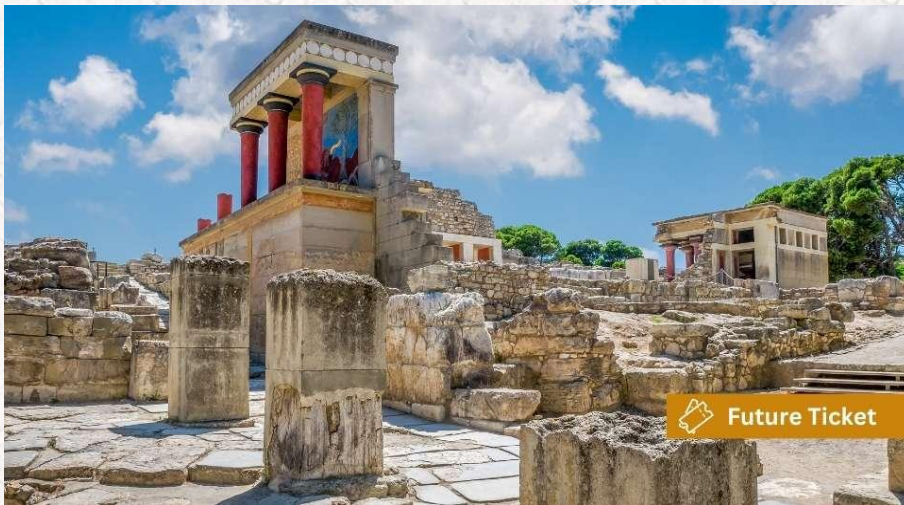
Knossos palace - Crete