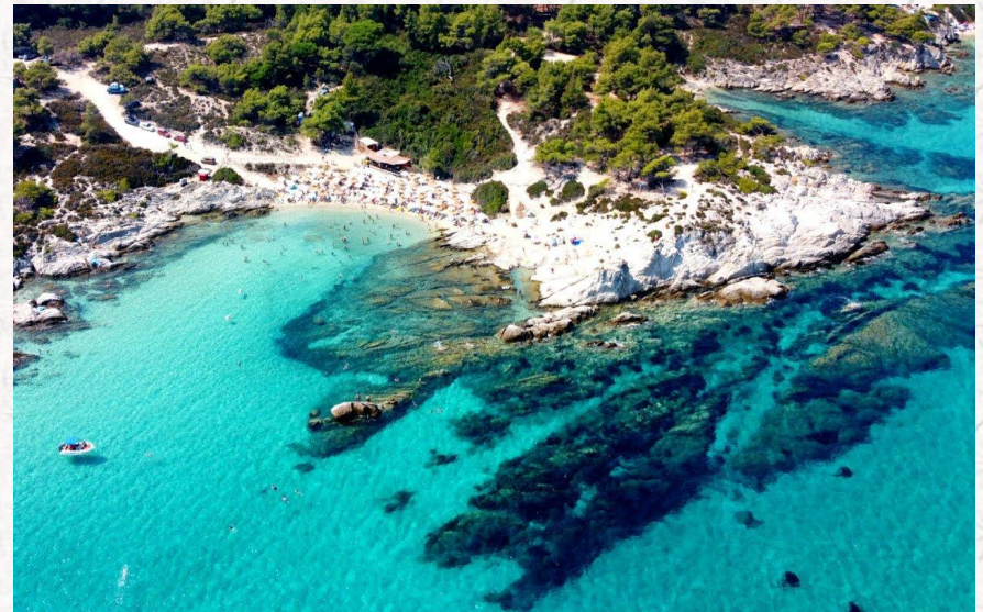
Kavourotrypes Beach - Sithonia, Halkidiki