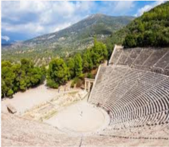
Epidauros ancient theatre