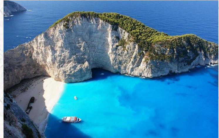
Navagio Beach (Shipwreck Beach), Zakynthos