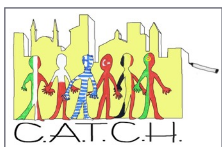
The Belgian logo

The first challenge of our alliance was: “create a nice logo which represents architecture and the six countries, Turkey, Italy, Greece, Portugal, Poland & Belgium”.