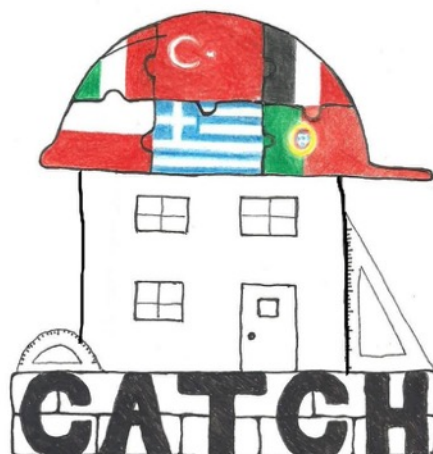
The Portuguese logo