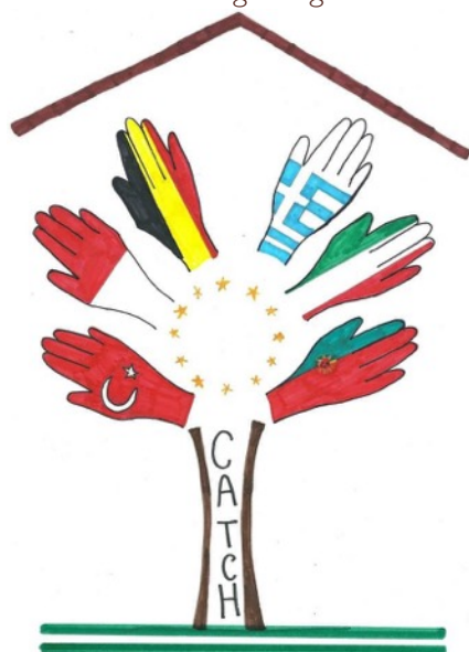
The Italian logo