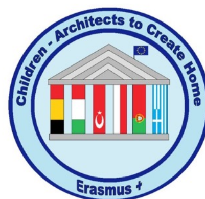
The Polish logo