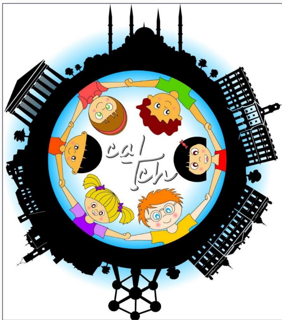
The winner: Turkish logo