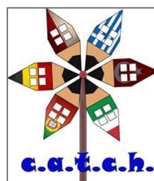
The Greek logo

Without any doubt every country started working very hard with beautiful results. At the end the best logo from each country were up for the elimination. Every country had two votes, after almost having an ex aequo we had an official winner: the Turkish logo.