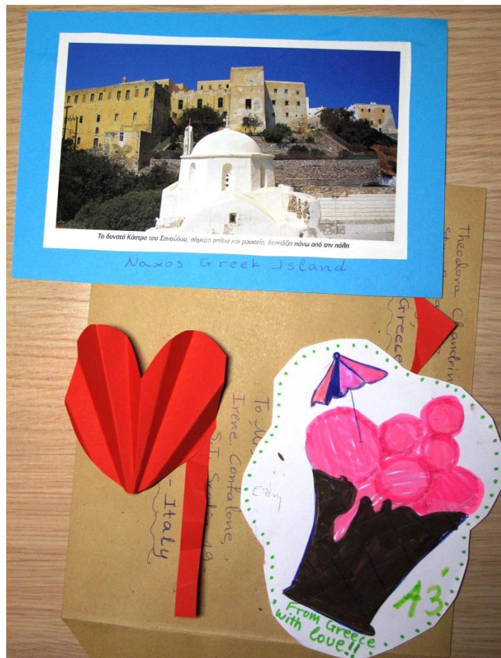
Sent to Italy from Theodora Chandrinou- Greece – Surprise