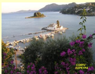
The Mouse Island

The island of Corfu is beautiful and it is west-north of Greece. There is also a little island called Mouseisland. The Mouseisland is like a little forest. There is a little church on it. In Corfu it rains during the winter but there are some rains during the other seasons, as well.