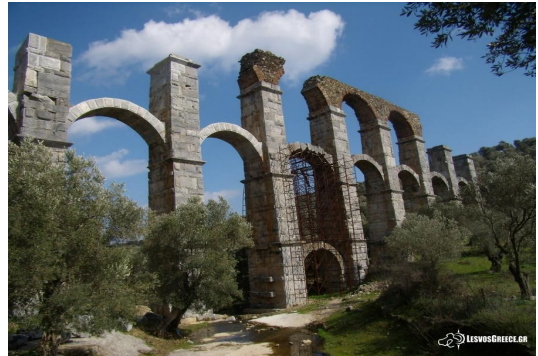
The Roman aqueduct in Moria