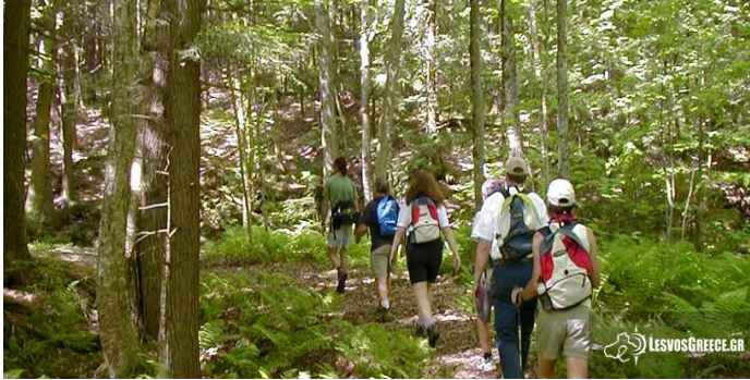
Hiking in the chestnut forest - Agiasos

Apart from lovely coastline and beaches, the island has something for everyone.