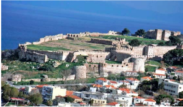
The Venetian castle of Mytilini