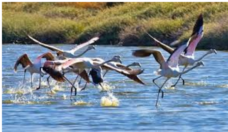
Bird watching in the Kalloni Gulf.