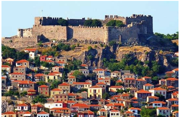
The castle in Molyvos