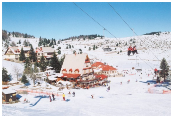
Skiing in Seli