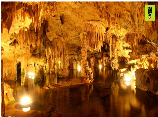
The Diros cave

But Greece is not only its islands. There are endless possibilities for the visitor which make it a popular destination all year round.