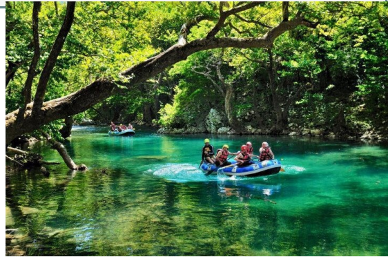
River rafting in Voidomatis

But Greece is not only its islands. There are endless possibilities for the visitor which make it a popular destination all year round.