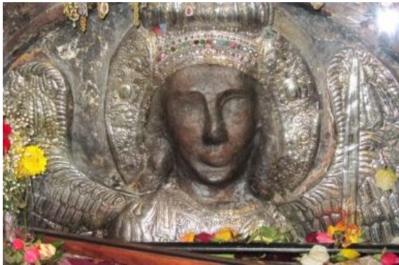
The icon of the archangel Michael in Mandamados

The island is also a popular pilgrimage for a lot of Orthodox Christians.