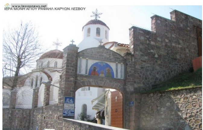
The convent of St Raphael