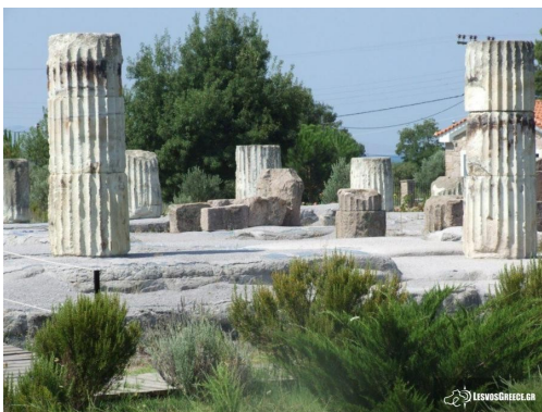
The temple of Messa