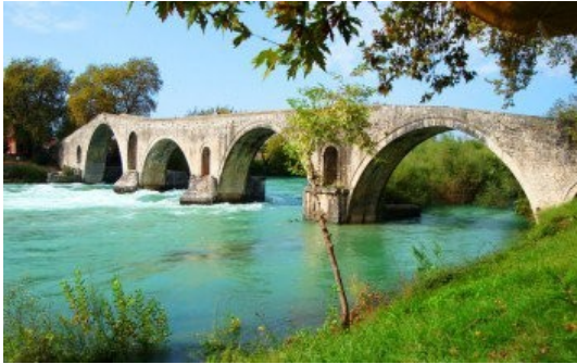
The 17th century bridge in Arta