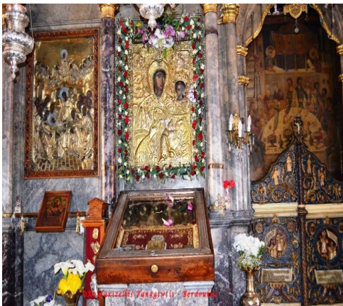
The assumption of Virgin Mary