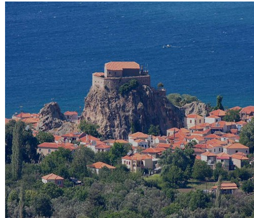
Virgin Mary on the Rock