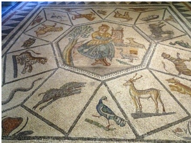
Mosaics from the Archaeological Museum