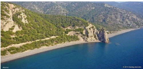
Vatera, 8kms long