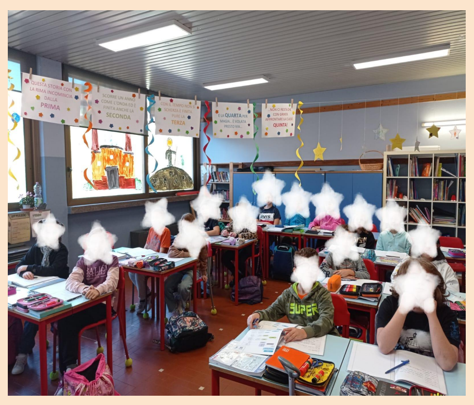
Every year we paint the windows of our classroom. This year we painted the International Space Station, the Solar System, an observatory and man on the Moon.