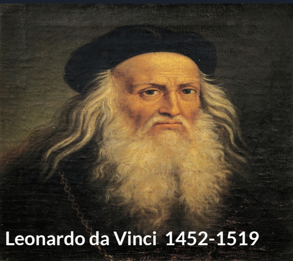
Leonardo da Vinci 1452-1519

The famous multi talented painter, was Italian.