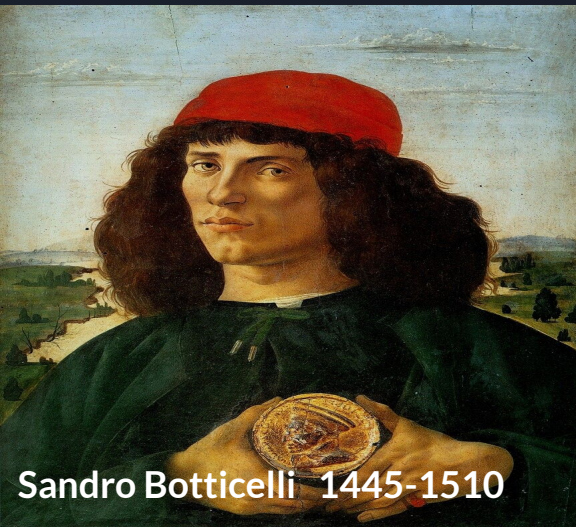
Sandro Botticelli 1445-1510

The successful painter, was also Italian.