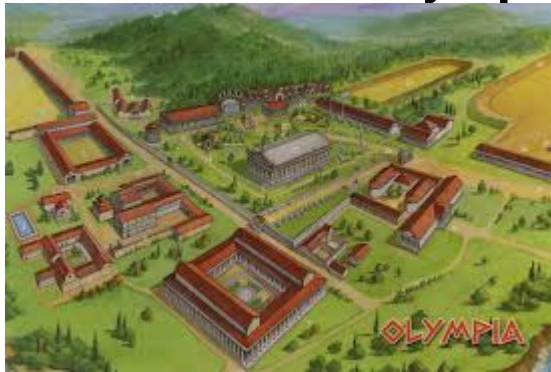
Map of Ancient Olympia