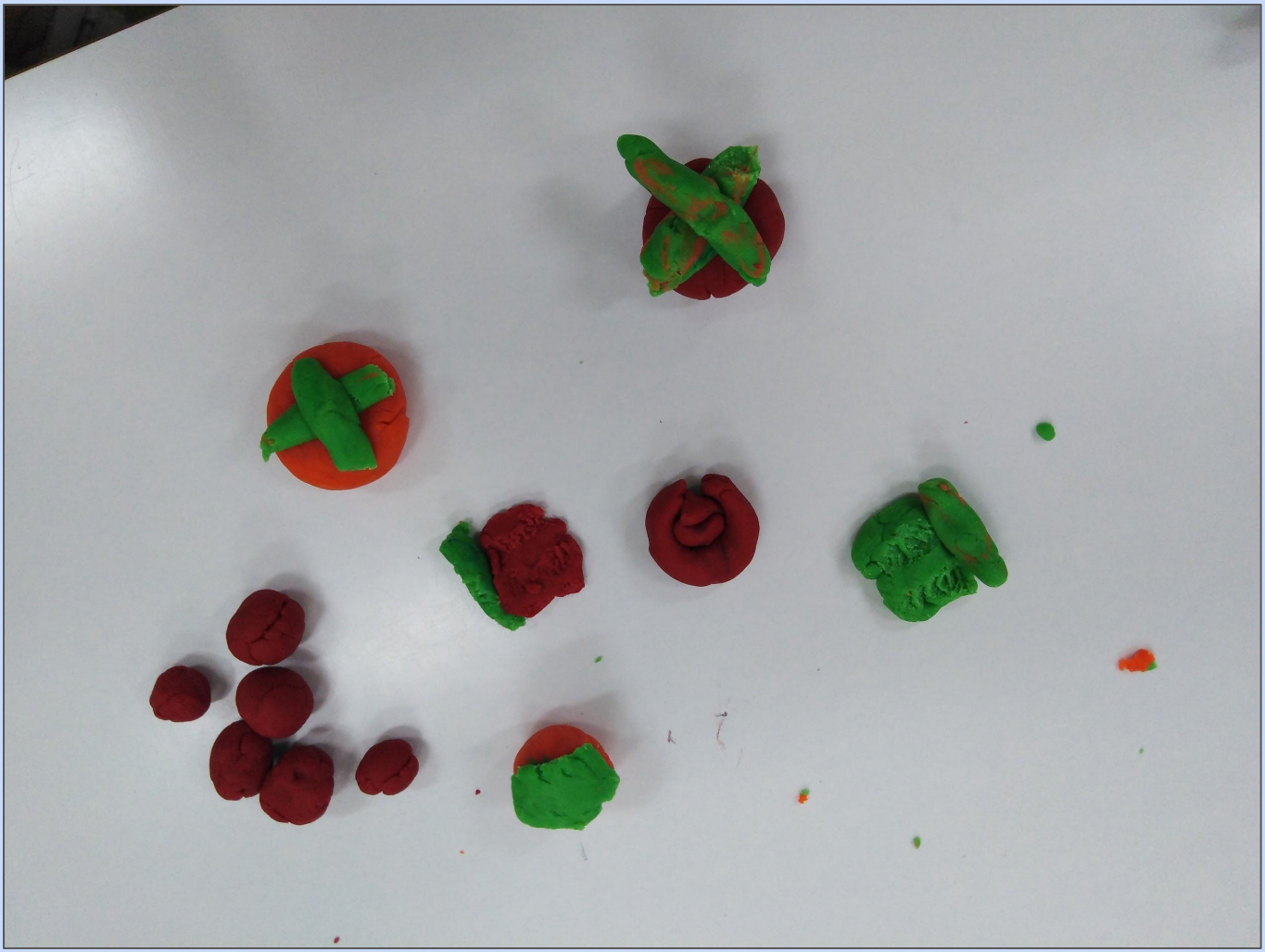
cherry tomatoes and beans