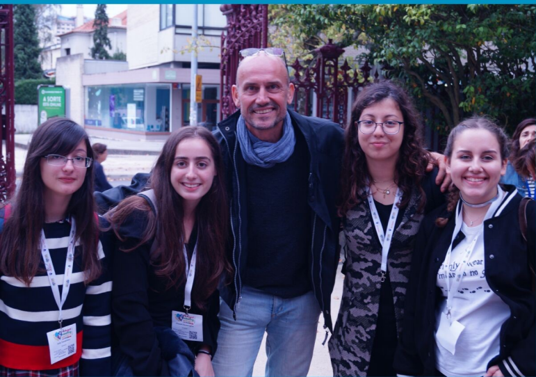
I love the Greek team...