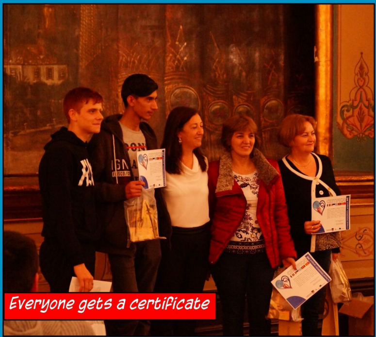
Everyone gets a certificate