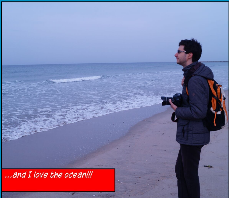
...and I love the ocean!!!