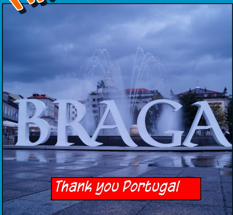
Thank you Portugal