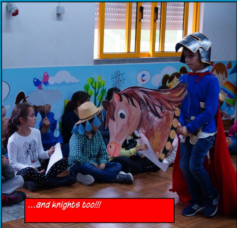
...and knights too!!!