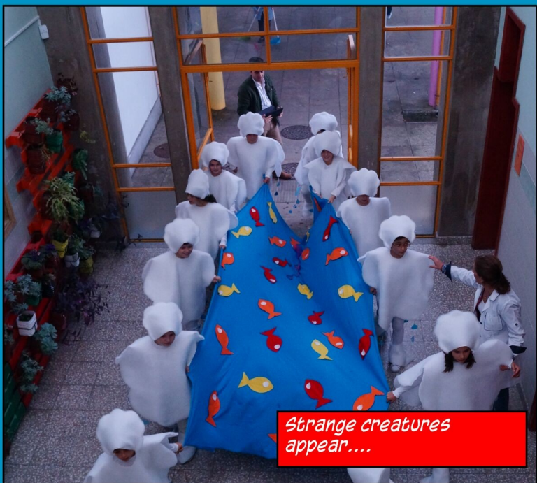
Strange creatures appear....