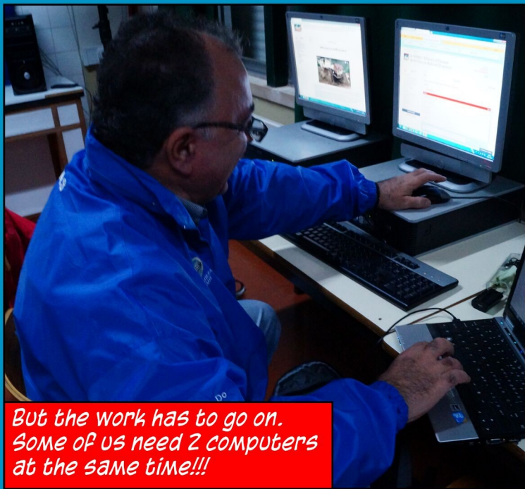
But the work has to go on. Some of us need 2 computers at the same time!!!