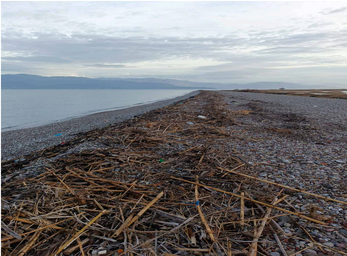
Aliki wetland in the winter with loads of litter

Aliki beach in Aigio, along with its associated wetland, is part of the Natura2000 network, representing areas crucial for the harmonious coexistence of humanity and nature. Despite ongoing efforts to enhance its condition, the wetland exhibits a concerning accumulation of waste. While the tides may wash some of it away, proactive measures are necessary to preserve the natural integrity of the environment. Debris is evident both within the wetland and along the adjacent beach, detracting from the experience of visitors to Aliki and posing a significant challenge to the ecosystem's functionality.