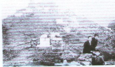
The castle in Sifnos

Sifnos is in Western Cyclades. Sifnos is a large island. The capital of Sifnos is Apollonia. There are mountains, rivers, lakes and there are 2000 people. In Sifnos you can see the theatre of Dionysos, sea, animals. The traditional food in Sifnos is cheese-pie and meat cooked in mastelo, which is a pot made of clay. The Festivals are organized by the Church.