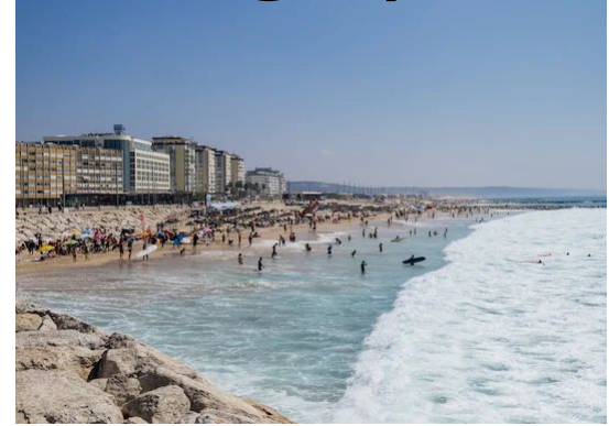
(Costa da Caparica)

The school officially belongs to the Almada region. It has 13km of beautiful beaches, a hospital, a big shopping center, museums, the town hall, monuments, hotels, many parks, libraries, etc.