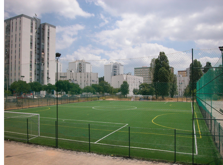
(One of our school's fields.)