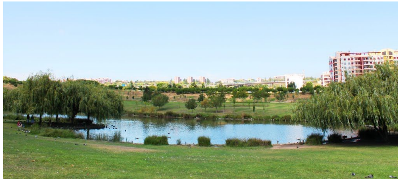
(Parque da Paz)

We love going to the beach and to go shopping.