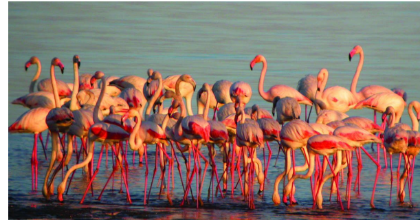
(Moinho de Maré de Corroios)