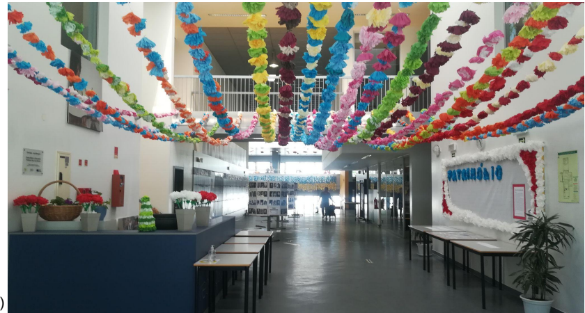
(Decorations for “Dia do Agrupamento”)

Our school is black and white. We have 4 buildings, 1 hall, 3 open air fields, 2 indoor fields, 1 kitchen, 1 bar, a place where you buy your meals, buy material and print your work, 1 vegetable garden, labs, a patio, 1 front desk, art rooms, etc. As you can see our school is very big. (Mirian, Sara, Pedro)