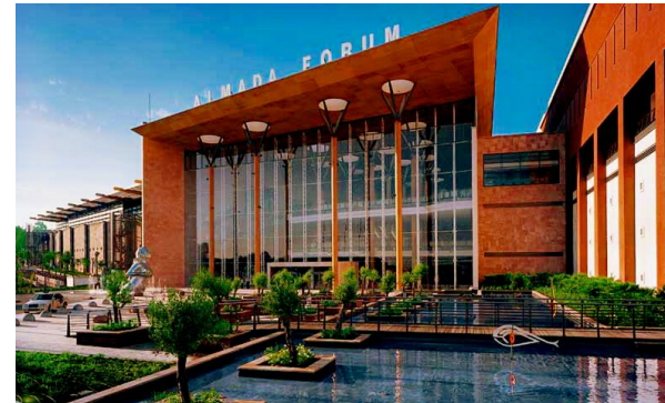
(Almada Fórum shopping center)