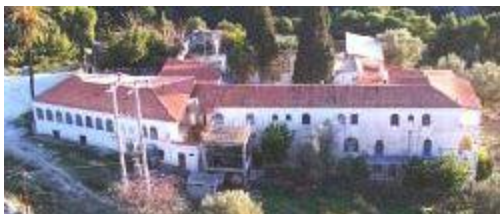
St. Nicolas Monastery

8. St. Nicolas Lemonia Historic Monastery 17th c. – St. John Kalivitis Chapel 10th c. Situated in a pine tree forest, south of the island towards Kanakia.