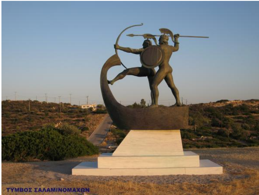
A monument dedicated to the sea battle of Salamina that took place in 480 B.C.