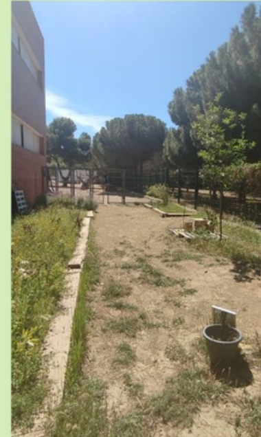
This is our biodiversity space