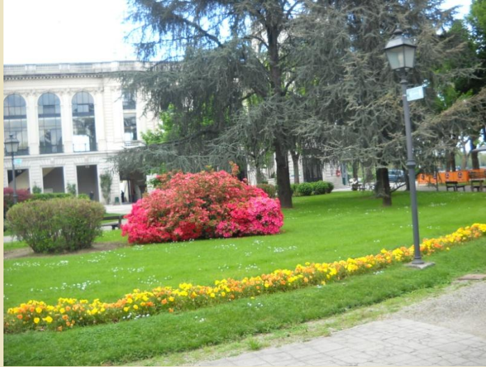
Racecourse of Milan