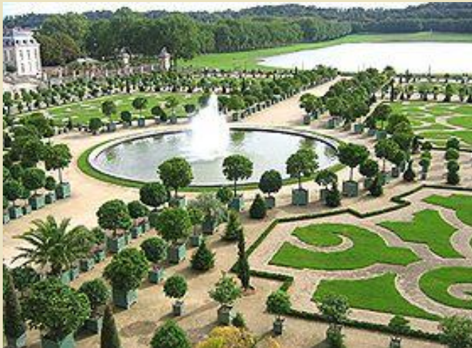
Chateau of Versailles

The principles and techniques of Italian gardens spread through Europe during the 16 th and 17 th century, influencing the creation of two basic European styles, French and English. The French style was characterized by strict a complicated symmetrical and geometric planting of beds and paths, whereas the English garden presented an idealized view of nature with a pleasant anarchy of shapes and colors.