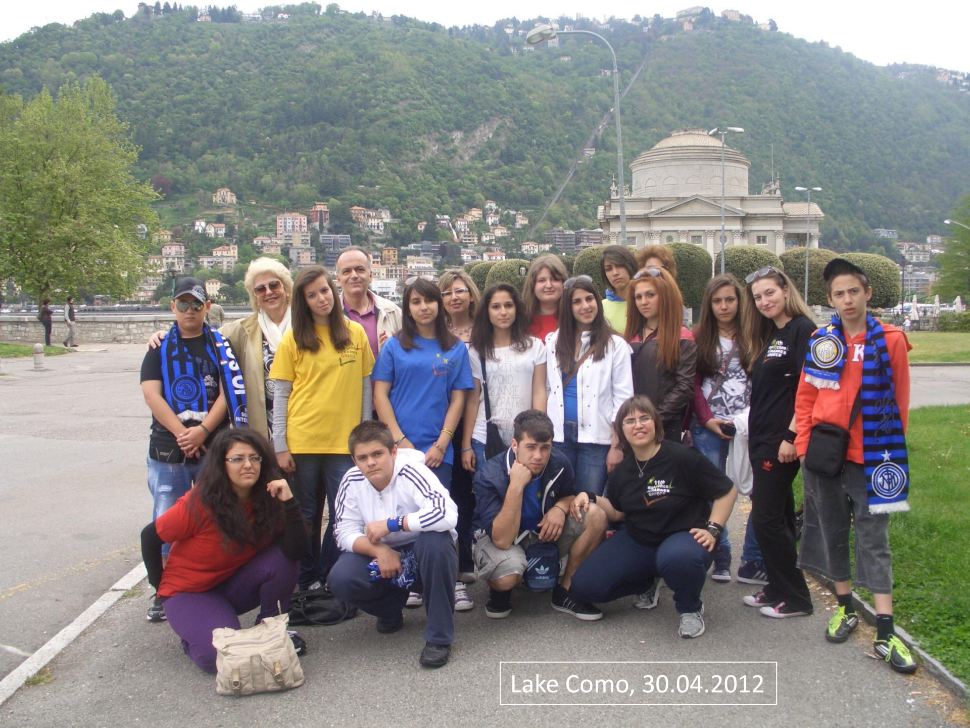
Lake Como, 30.04.2012