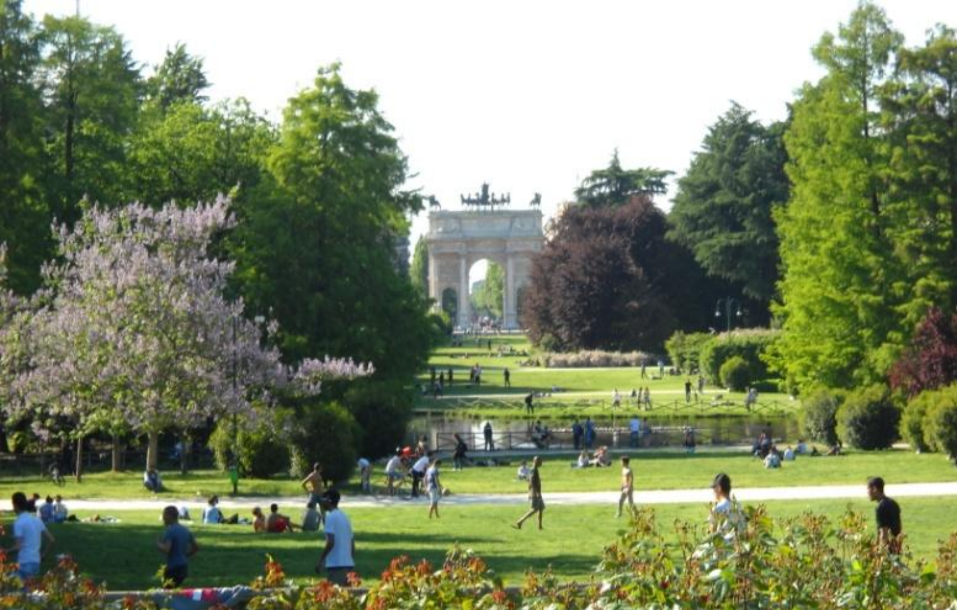
View of Parco Sempione & Arco della pace from the garden of Sforza Castle