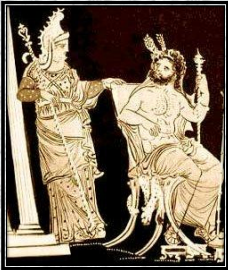
Minos and Rhadamanthe