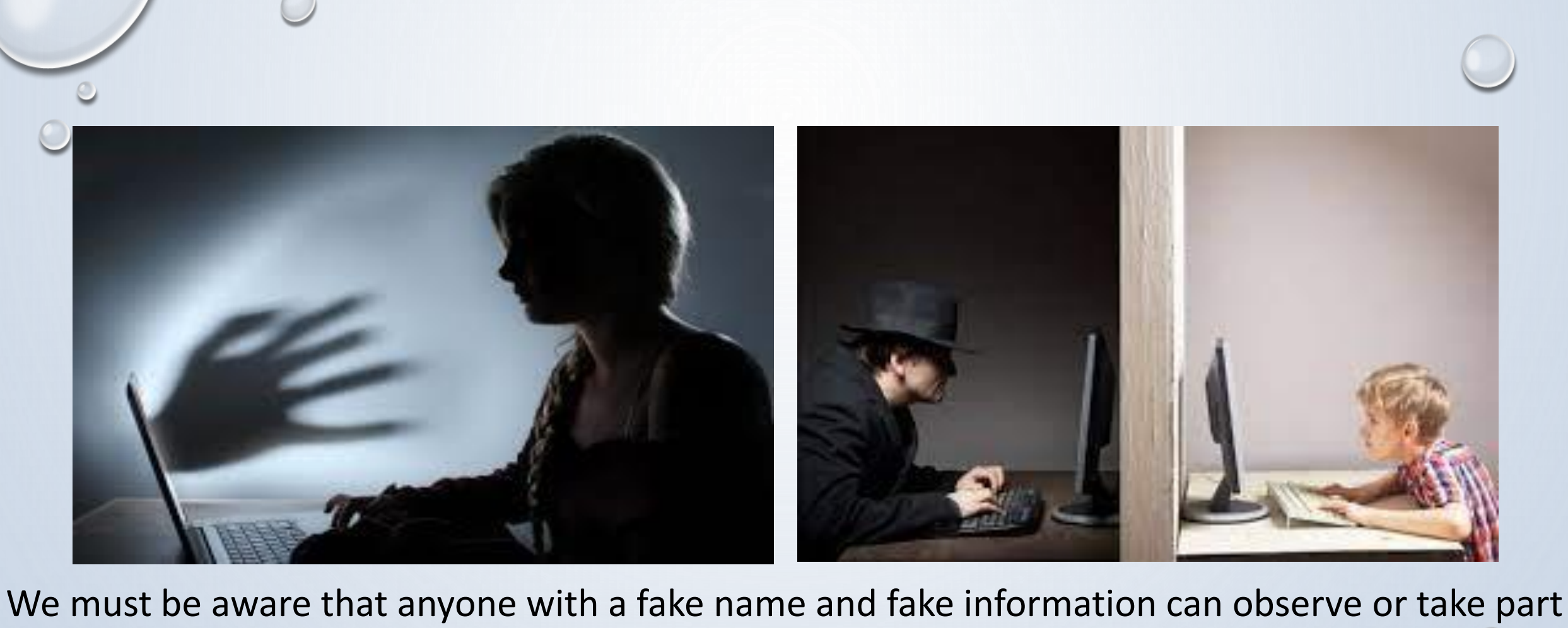
We must be aware that anyone with a fake name and fake information can observe or take part in our conversations.